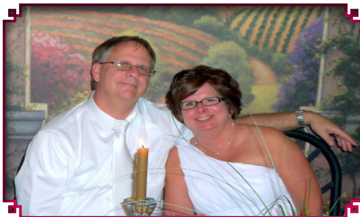
Introducing Mr. and Mrs. Michael Vick!