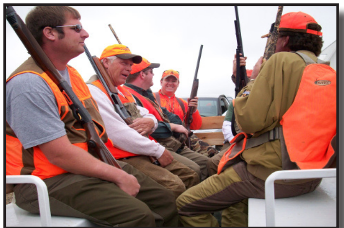
The Pheasant Hunt participants share a little camaraderie as they ride to the cornfields of the Oak Tree Lodge. This was the hunters' first day out for the 2011 Pheasant Hunt season.